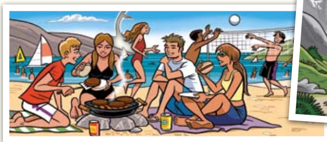
have a barbecue on the beach