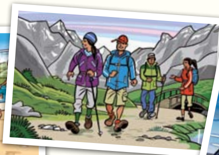
go trekking in the mountains