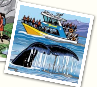
go whale watching

3 Practice the conversation. Use the pictures above.