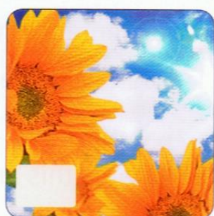
They grow toward the sun.