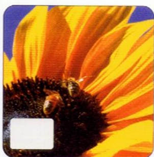
Bees sip from them.