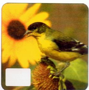
Birds love sunflowers.