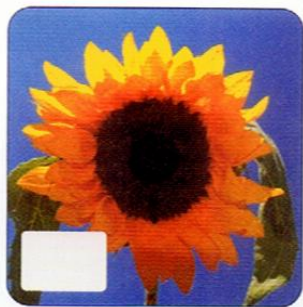
They are big, yellow flowers.